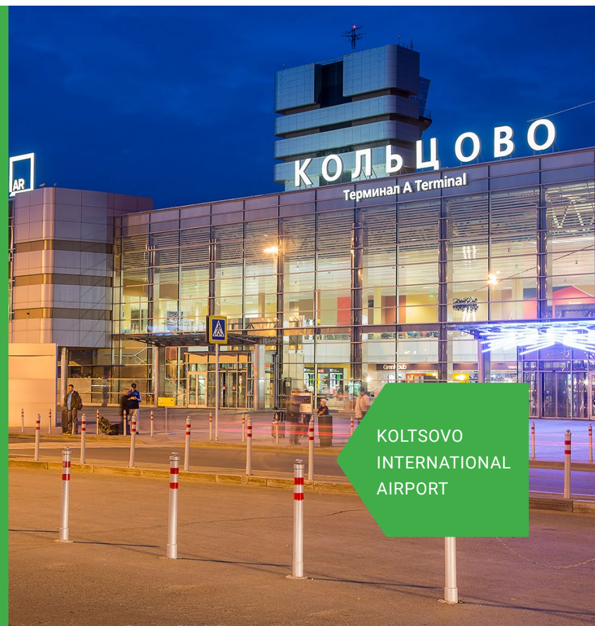
KOLTSOVO INTERNATIONAL AIRPORT